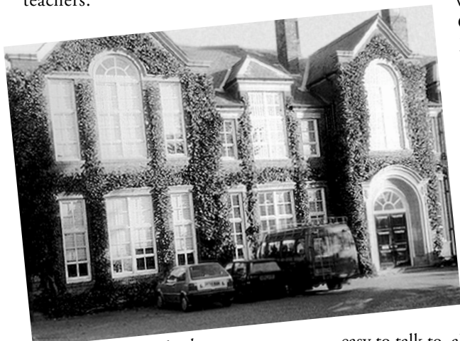
Neathered High School