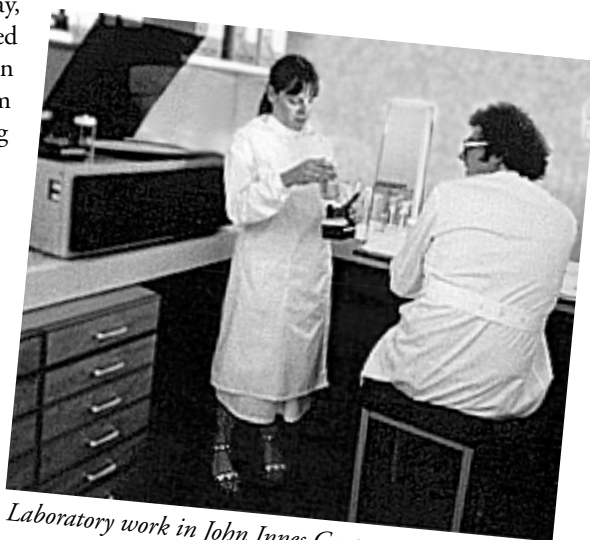
Laboratory work in John Innes Centre

Next summer several research fellowships will be available for teachers who are members of the Network. This may seem a long way ahead, but now is the best time to think about the scheme and to see what it might offer you and your school. Many learned societies in the US now sponsor similar teacher fellowships and enough has been learned to know that they are a valuable national resource, with real benefits to teachers, children, and scientists. We believe it will become a vital activity of the TSN.