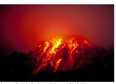
nage, British Geological Survey, P06369

causes of these hazards and their interactions with society will be explored. You will have time to visit the European Geosciences Union's general assembly and interact with teachers from around Europe and beyond.