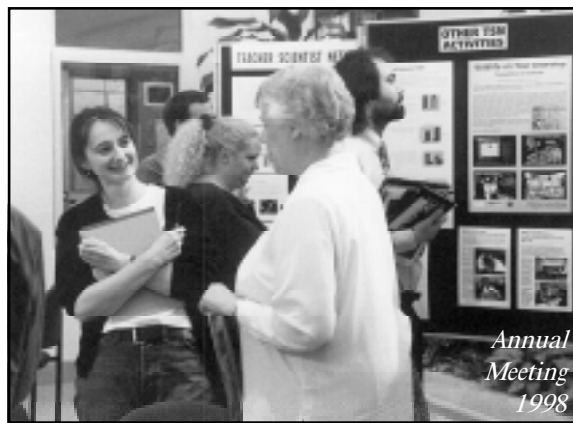
Annual Meeting 1998

Discussion this year centred upon how we might support primary school science, as we do with 'master classes' for high school teachers. We now have funding for this support and are exploring ways of working with the LEA to provide this. Watch this space.