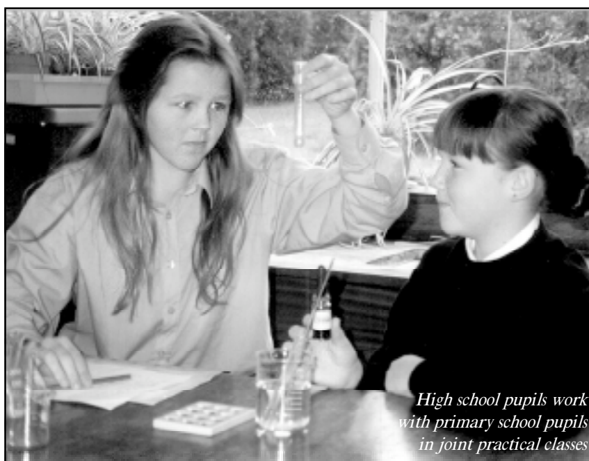
High school pupils work with primary school pupils in joint practical classes