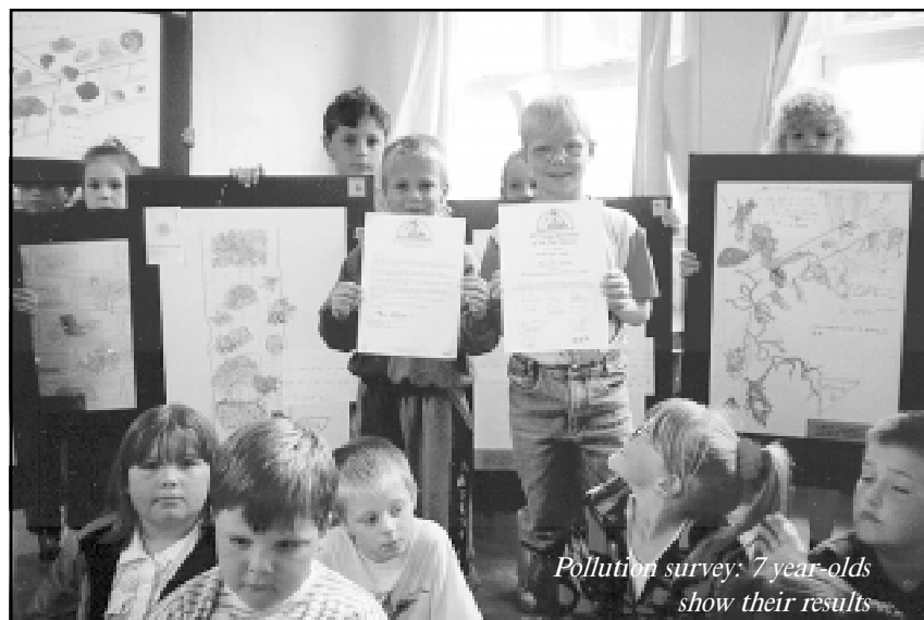
Pollution survey: 7 year-olds show their results

mented on their work and they were thrilled to be awarded a certificate signed by David Bellamy.