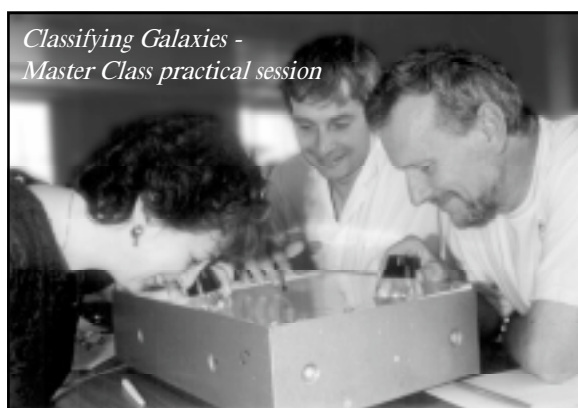
Classifying Galaxies - Master Class practical session