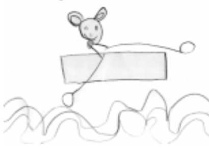
1 Put him in a boat.