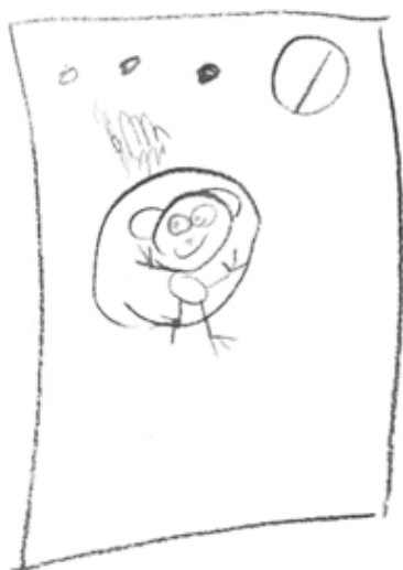
3 Put him in the washing machine!