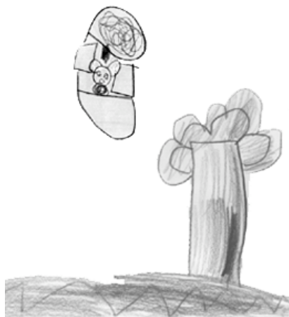
2 Put him in a hot air balloon